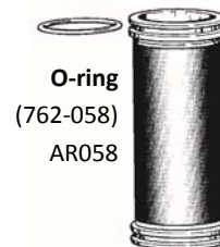
O-ring (762-058) AR058